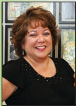
By Alice O'Hearn